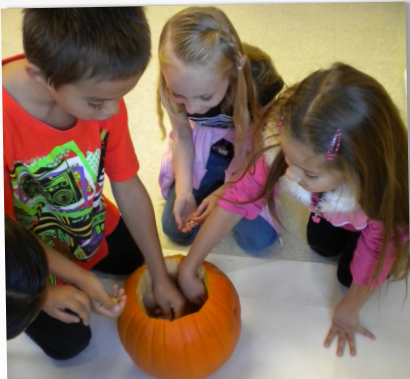
HANDS ON EXPERIENCES