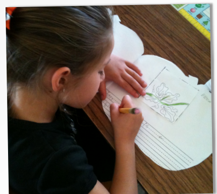
EXPOSITORY READING AND WRITING